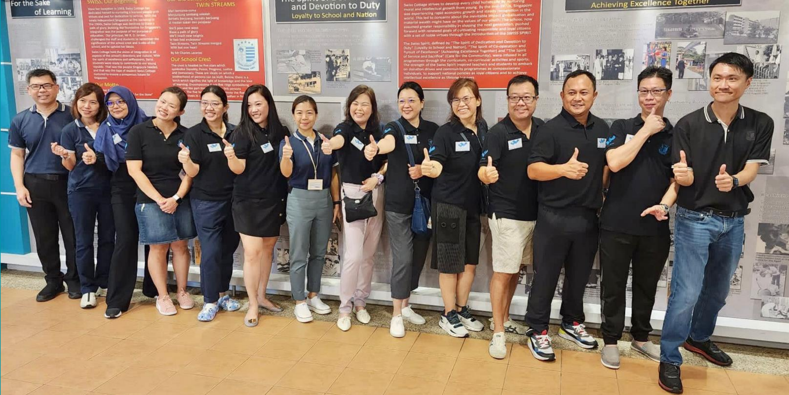
Swiss Parent Support Group